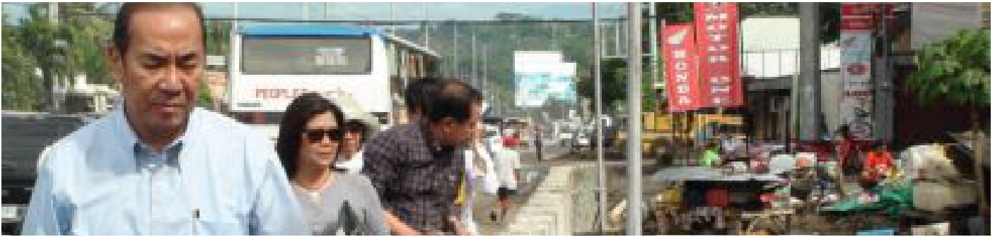
Public Works and Highways Secretary Rogelio Singson inspects the Matina Bridge and Pangi Bridge in Davao City, which were severely affected by the recent flashflood.