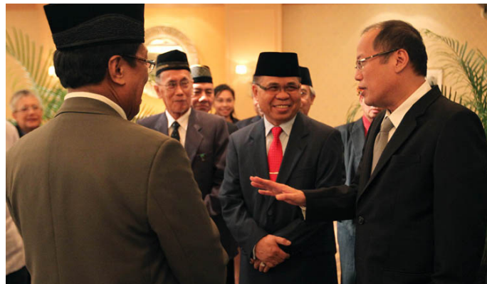
President Aquino with Chair Al Haj Murad Ibrahim and MILF members during an informal meeting in Tokyo, Japan.